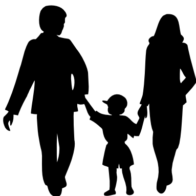
Consistency across adults is helpful

Children learn more easily when the same “contingencies” (rules) apply every time a situation arises. When an adult allows a behavior to occur sometimes, but other times doesn't, the child has a 50-50 chance of displaying the behavior again. A parent or teacher should therefore be fairly consistent to increase the odds of the child learning appropriate behavior.