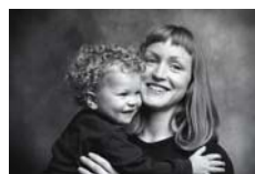
Keep a child engaged to prevent behavior problems

Some parents and teachers are masters at preventing behavior problems by keeping children busy. Children can do only so many things at one time, so, if they are appropriately "engaged" in a game, with a toy, or just hanging out with other people, they are less likely to be