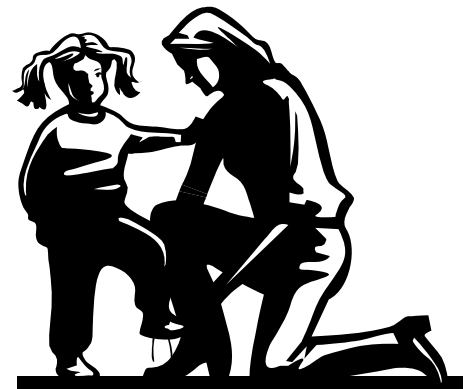
Discipline is teaching