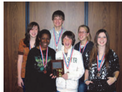
3rd Place Murray County Central #1

A total of 95 teams from 34 school districts competed in two Jr. High Knowledge Bowl Sub-Regional events on January 3 and 4 at SMSU in Marshall. After a written round and four oral rounds, the following teams were declared winners: