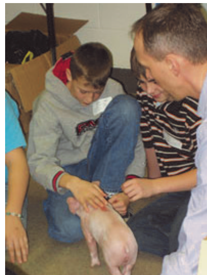
GRUNTS AND SQUEALS