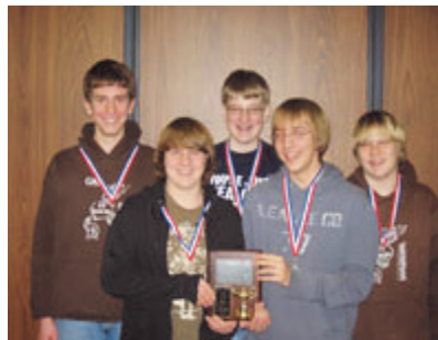
2nd Place Glencoe/Silver Lake #1